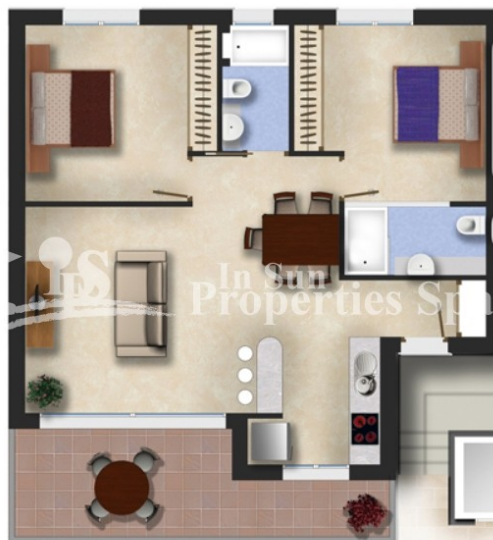
Imagen Artística carece de valor contractual/Artistic Image free of contractual nature

Model: 1 o Floor Property: 88,26-94,23m 2 2 Bedrooms - 2 Bathrooms