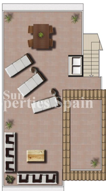
Imagen Artística carece de valor contractual/Artistic Image free of contractual nature