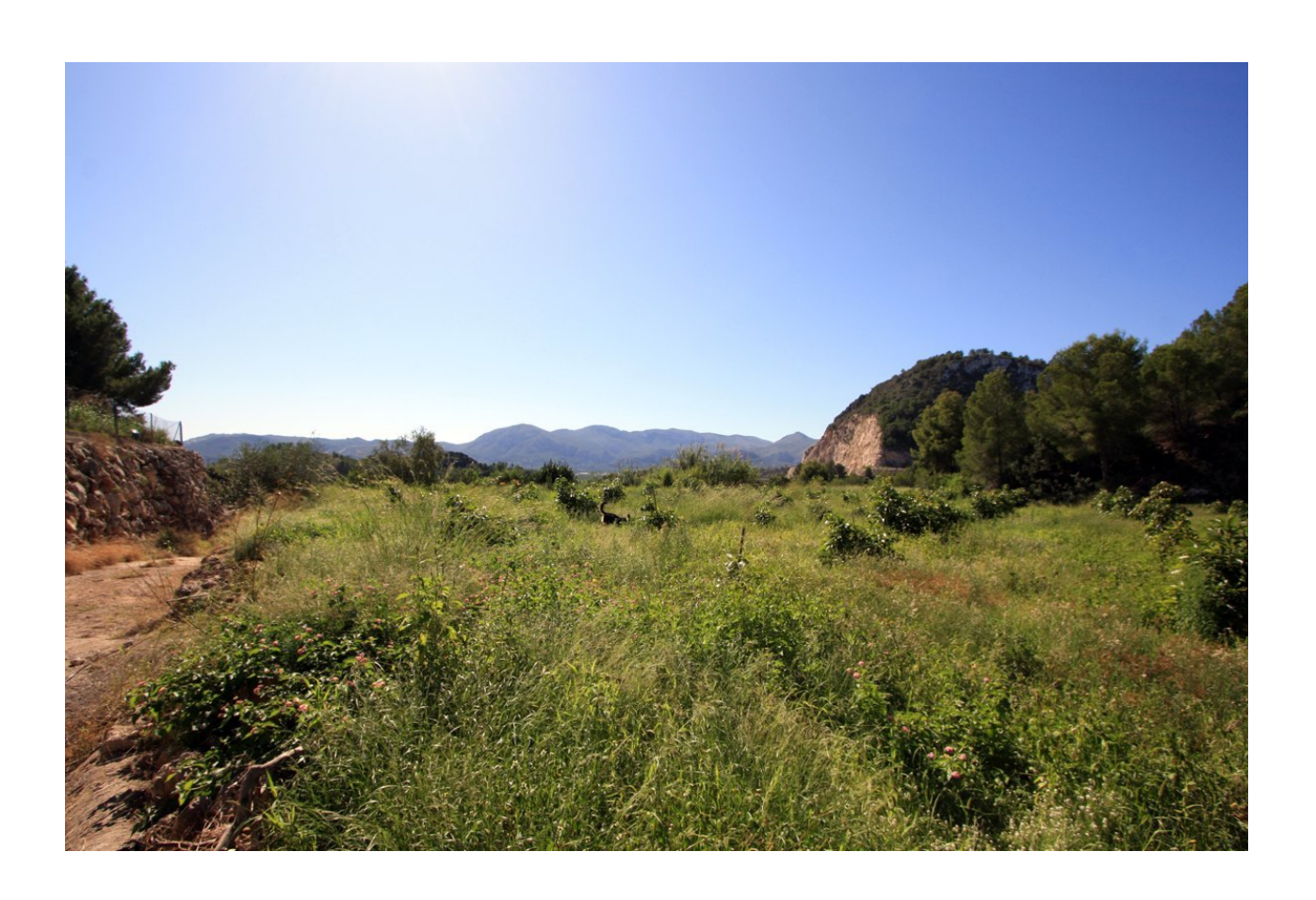
"OUR EXPERIENCE IS YOUR GUARANTEE"