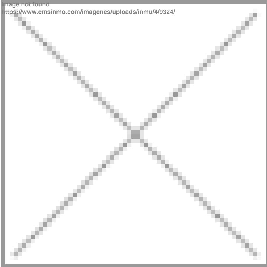
Image not found https://www.cmsinmo.com/imagenes/uploads/inmu/4/9324/